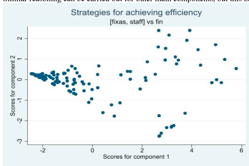
Picture 1. The higher the overall efficiency, the more noticeable the sources of its achievement

Similar reasoning can be carried out for other main components, but this is beyond the scope of this study.